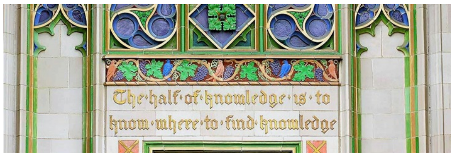
Façade of Dodd Hall, Home of FSU's Department of Religion