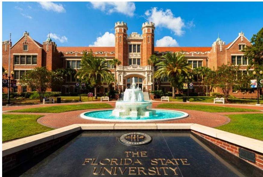
Westcott Building, Florida State University