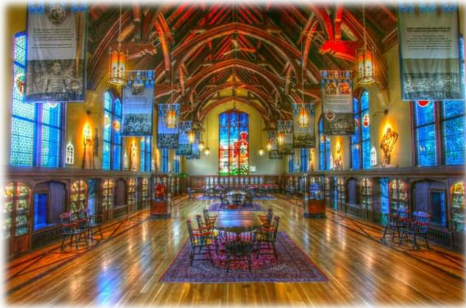
Florida State University Heritage Museum in Dodd Hall, Home of FSU's Department of Religion

March 11 – 13, 2022, Online (All Events Scheduled in Eastern Time)