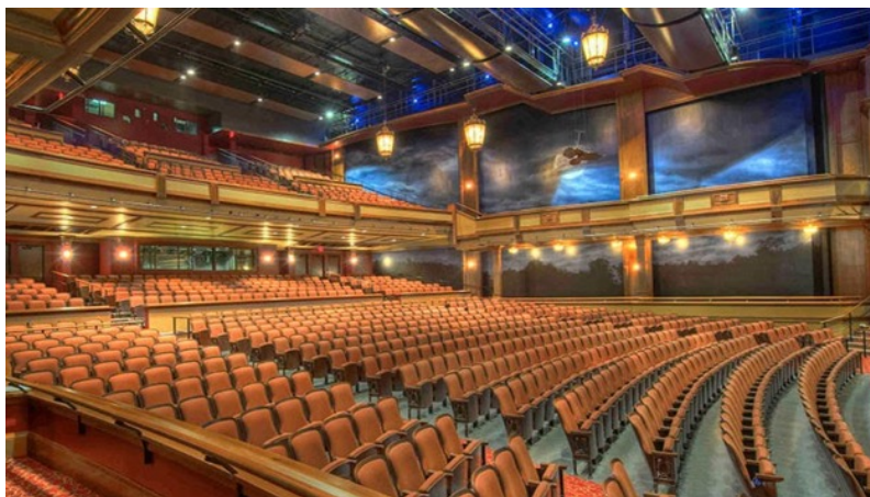
Florida State University's Ruby Diamond Concert Hall, Westcott Building