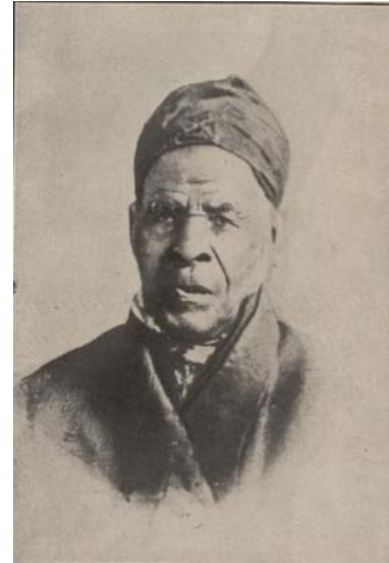
Omar ibn Sayid (1770-1864)